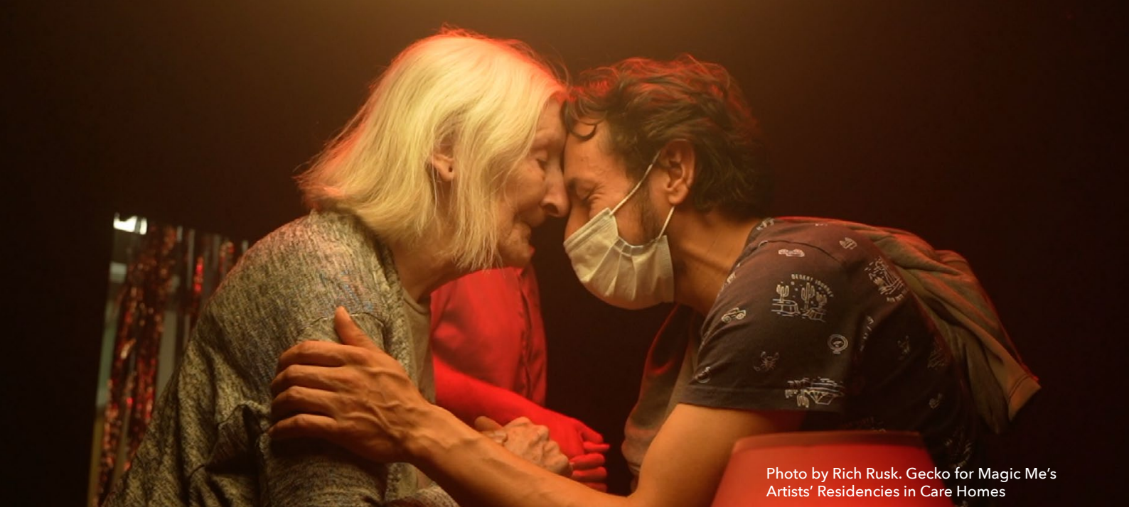
Gecko for Magic Me's Artists' Residencies in Care Homes