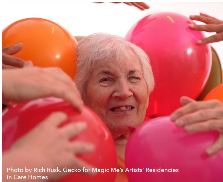
Gecko for Magic Me's Artists' Residencies in Care Homes

Set up a dedicated art group and explore different art forms, using online resources to help you. Explore a different art activity every month; visual arts, creative writing, drama, dance and crafts.