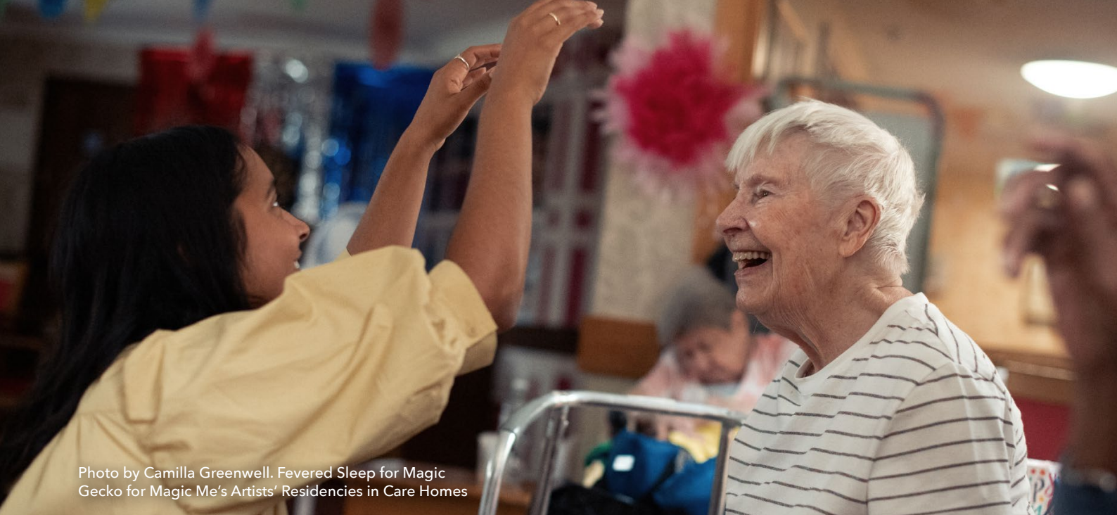
Fevered Sleep for Magic Gecko for Magic Me's Artists' Residencies in Care Homes