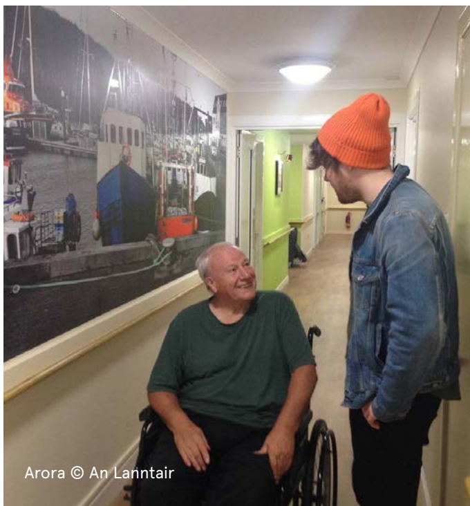
Arora © An Lanntair

The funding for Hudson's fixed term post ends early in 2018, but, he says, the venues are already committed to employing a full-time, permanent creative ageing co-ordinator, "which will open it up a bit more so we're looking at the 50-plus age bracket. We're thinking more strategically."