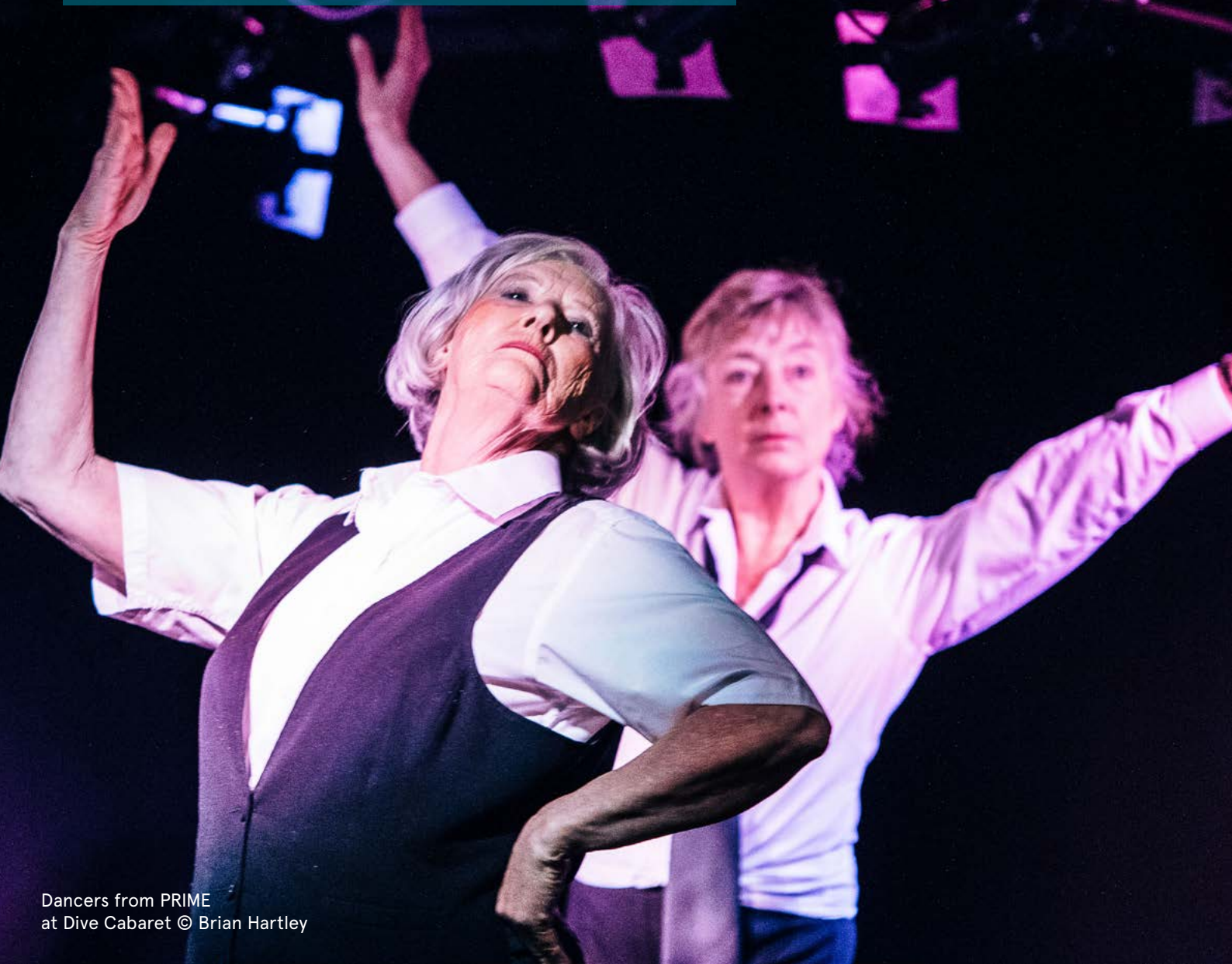
Dancers from PRIME at Dive Cabaret

“The arts can help people take responsibility for their own health and wellbeing in ways that will be crucial to the health of the nation”