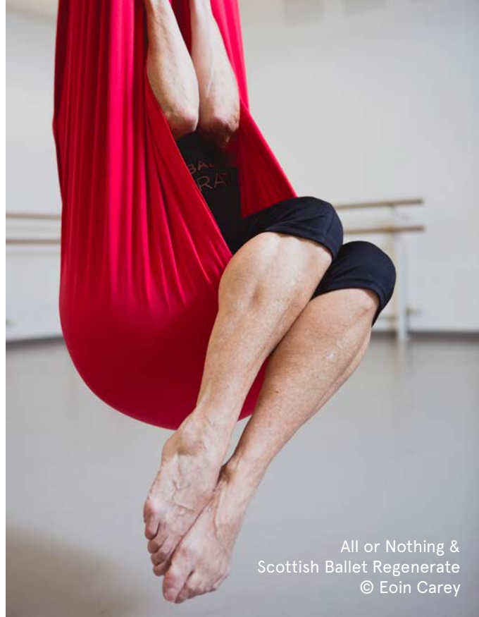
All or Nothing & Scottish Ballet Regenerate