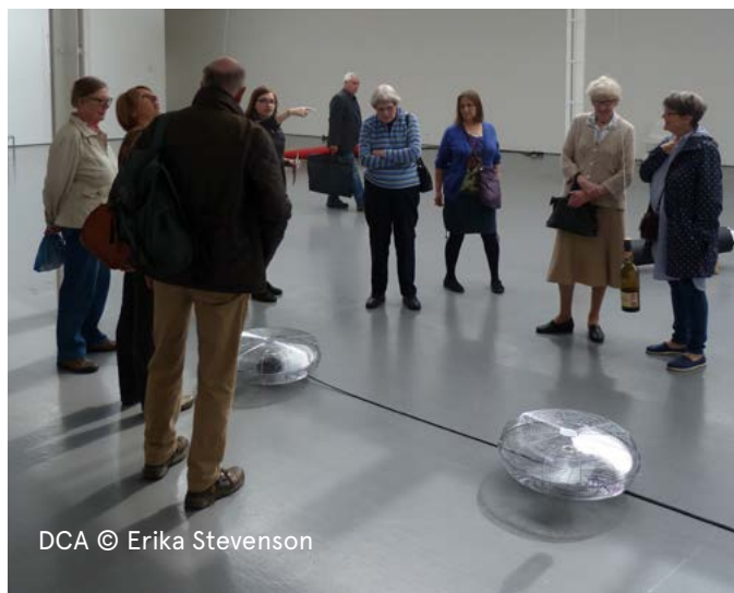
DCA