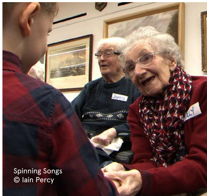
Spinning Songs