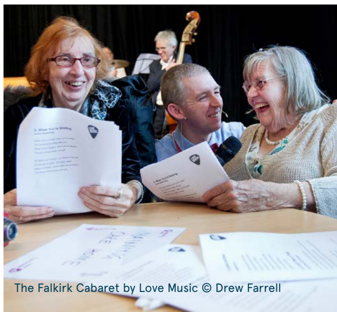
The Falkirk Cabaret by Love Music