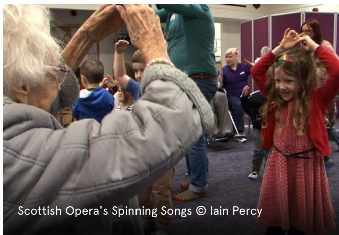
Scottish Opera's Spinning Songs